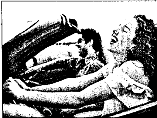
SAY GOODBYE TO ROAD MAPS

To test their idea, the researchers used three months of movement data, representing 400 million kilometres of