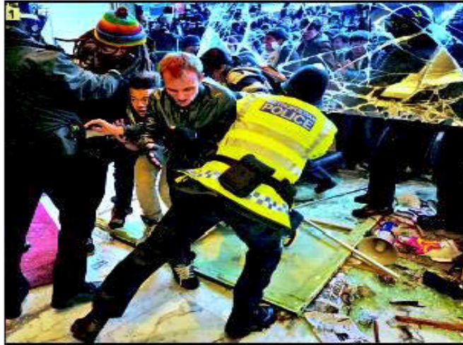
STATE OF UNREST: Police officers clash with demonstrators at the headquarters of UK's ruling Conservative Party; (R) demonstrators hold placards during a student protest march, in central London

The incident occurred when a section of an estimated 50,000 strong demonstration turned violent. It led to a quite unprecedented episode on British soil, which has not witnessed restlessness among students of this scale since the 1960s. Waving anarchist flags, masked men lobbed placard sticks, eggs and bottles, even fire extinguishers, while also