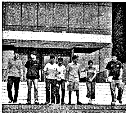
YOUNG AT 50: The golden jubilee of the institute and the IIM system will be celebrated over two years starting November 14