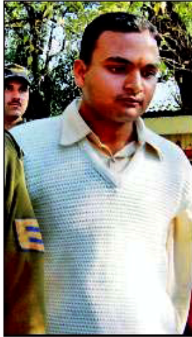
One of the four accused leaves the court in Dharamshala